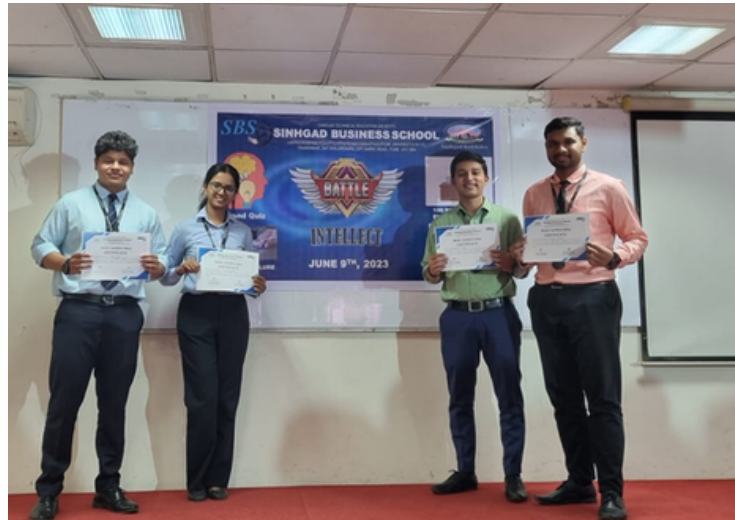
Winner and 2nd Runner Up in Brand Quiz Organized by SBS, Erandwane