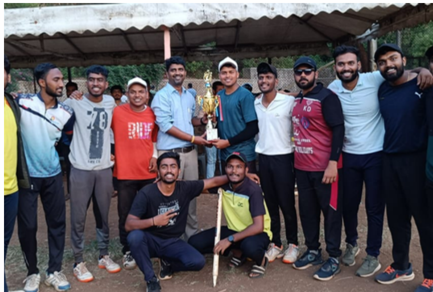
Winner in Cricket Championship, Organized by SIOM, Wadgaon